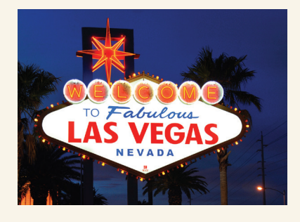
2019 Specialty Day Meeting

Date: October 10-12,2018 Location: New York, NY