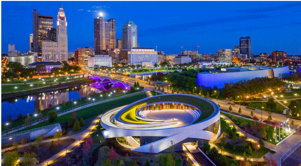
Columbus, Ohio, site of the MSTs Annual Meeting in 2021