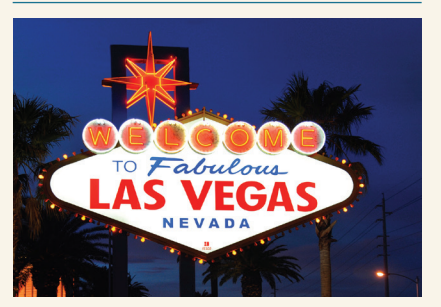
2019 Specialty Day Meeting Date: March 16, 2019 Location: Las Vegas, Nevada